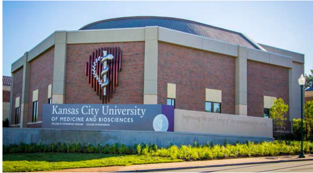
Kansas City Campus